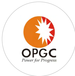
Odisha Power Generation Corporation Ltd.